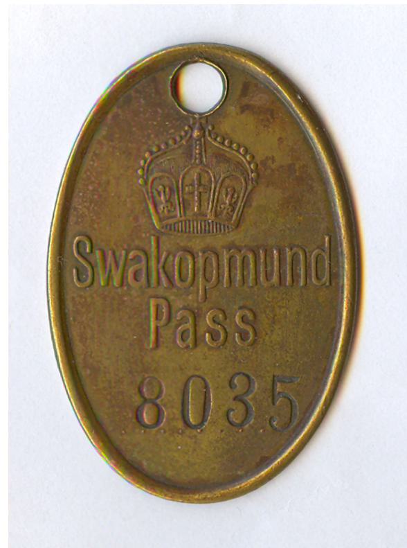
Metal pass tokens, worn around the neck, were issued during and after the war to restrict native Namibians’ travel. This pass was acquired by a missionary. It is unknown who wore it.

Some German missionaries were alarmed by the extermination order and asked the German government to change the policy. German farmers and industrialists, too, asked to spare the lives of native Namibians because they wanted to use them